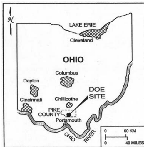
Figure 1.2. Location of PORTS within the State of Ohio.

The DOE, through its managing contractors, is responsible for the Environmental Restoration, Waste Management, and Uranium Programs at the plant, as well as other nonleased DOE property. The Environmental Restoration Program performs remedial investigations and remedial actions to define the nature and extent of contamination, to evaluate the risk to public health and the environment, and to remediate areas of contamination at PORTS. The goal of the Environmental