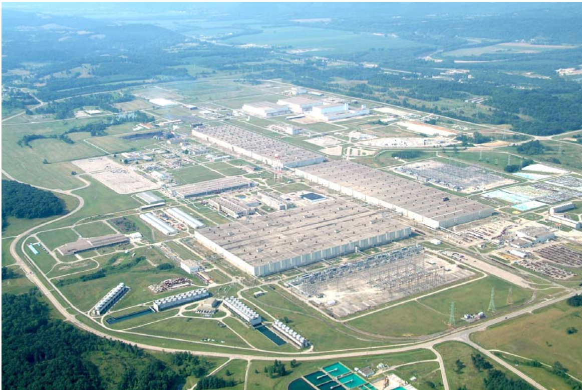
Figure 1.1 The Portsmouth Gaseous Diffusion Plant.

PORTS, which began operation in 1954, is owned by the DOE (see Figure 1.1). Effective July 1, 1993, the DOE leased the uranium production facilities at the site to USEC, which was established by the Energy Policy Act of 1992. The DOE is responsible for certain environmental restoration and waste management activities, uranium programs, and long-term stewardship of nonleased facilities at PORTS.